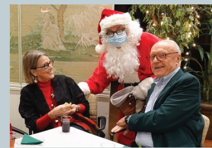
Just before Christmas, Santa Claus visited the residents for “Sips and Bits” to spread a little holiday cheer, offering sweets and treats to all. He also joined the group to sing holiday carols.