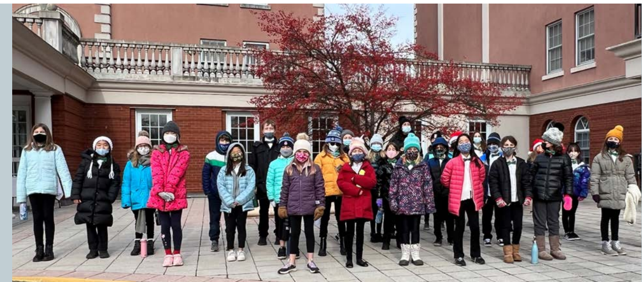
A frigid December day was quickly warmed up by the Osborn School chorus performing their annual holiday concert for our Osborn community. It was a joy for all!