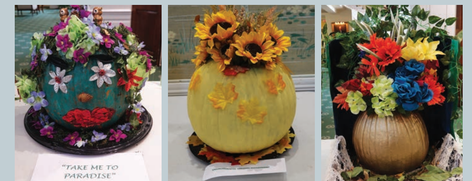
Staff put their creativity on display by decorating pumpkins for the annual Osborn Halloween pumpkin decorating contest. Residents judged the submissions and picked the lucky winner.