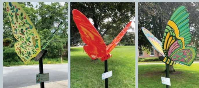
The Rye Rotary, including members of The Osborn’s senior management team, participated in the inaugural Rye’sAbove campaign. Pictured above are some of the beautiful, one-of-a-kind butterflies that adorned the City of Rye during 2021.