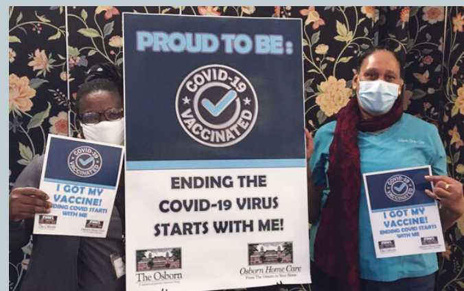
The Osborn was an early provider of COVID-19 vaccinations and held clinics throughout the year to ensure the safest environment possible for our residents and staff.