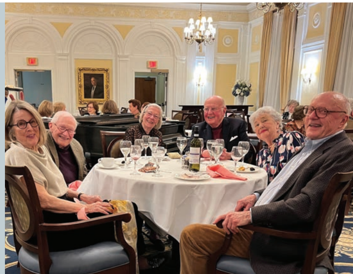
The Osborn's residents look forward to fine dining every day. They were so pleased when communal dining was once again an option in our gorgeous dining rooms. Meals are also a wonderful opportunity for socialization.