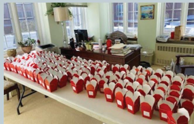
The Osborn celebrates the holidays throughout the year and offered to our residents a sea of good fortune and love for Valentine's Day and the Chinese New Year.

Osborn residents enjoy the changing seasons on our beautiful 56-acre arboretum campus. The month of April brings cherry blossoms.