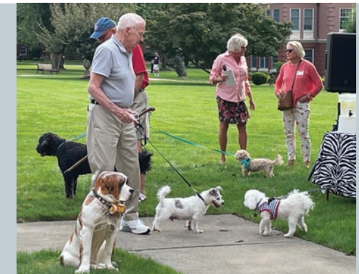
Osborn residents look forward to our Dog Days of Summer event, a favorite for both two-legged and four-legged guests. Dogs join the residents for an afternoon filled with Paws on Parade, pool plunges, and lots of ball chasing. It's a paw-tastic time for all!