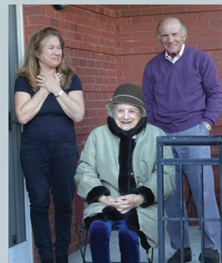
Many staff members came out on the South Lawn to applaud and honor one of our residents celebrating her 111th birthday at The Osborn. As you can see, she was delighted by those who gathered to wish her well and serenade her.

Staff and residents were treated to the annual spring fashion show. Residents modeled their resort wear from their favorite vacation destination. Plus, who doesn't love a little music and refreshments by our beautiful Sterling Park fountain in the springtime!