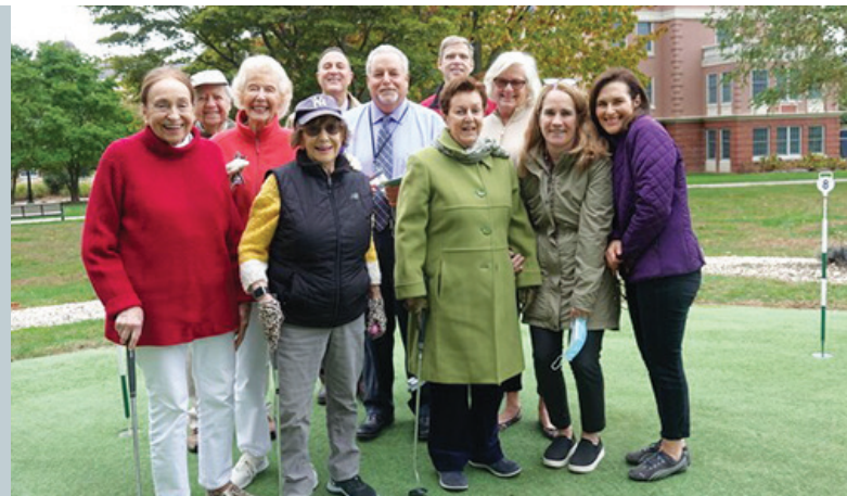
Although it was a chilly fall afternoon, the annual John Sterling Election Day putting tournament was a hit with both residents and staff! It’s terrific to have our own putting green!