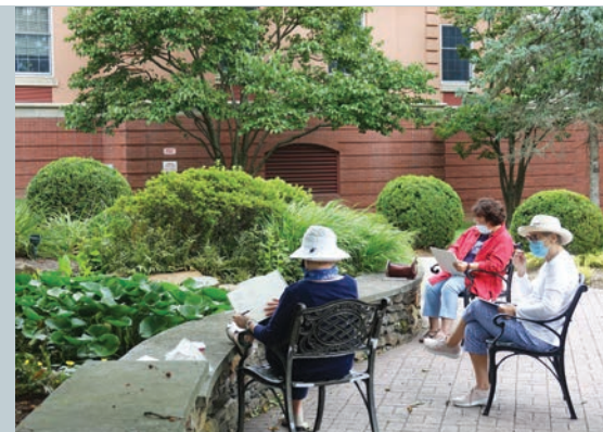
Even when indoor activities had to be suspended during the pandemic, residents were able to gather by the koi pond to find inspiration for their Plein air painting sessions.

Throughout the year, our residents take advantage of outdoor activities on our campus. Partnering with the Rye Nature Center, they got down and dirty to pot some spring blooming buds to make our campus even more beautiful!