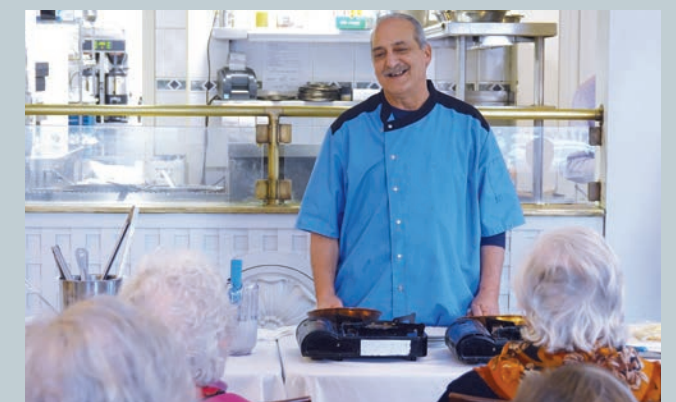
The Osborn residents dine on gourmet cuisine every day by our Culinary Institute of America trained Executive Chef. Here he shares his tips and tricks on how to make perfect breakfast omelets and crepes.